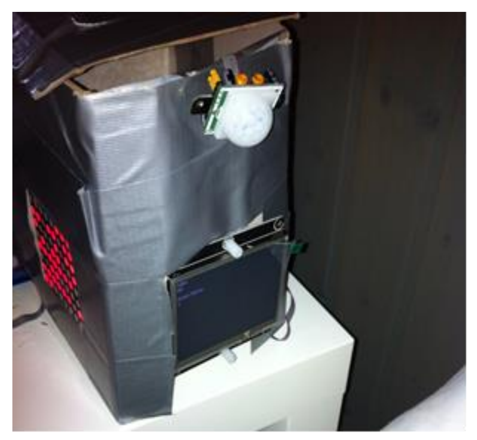
Figure 1: SleepCompete prototype. The LED Matrix displays the score visualization

We designed SleepCompete as a cube shaped bedside unit; the outside of our prototype can be seen in Figure 1. The design of the device should allow the user to be able to choose which 'face' of the unit they can see.