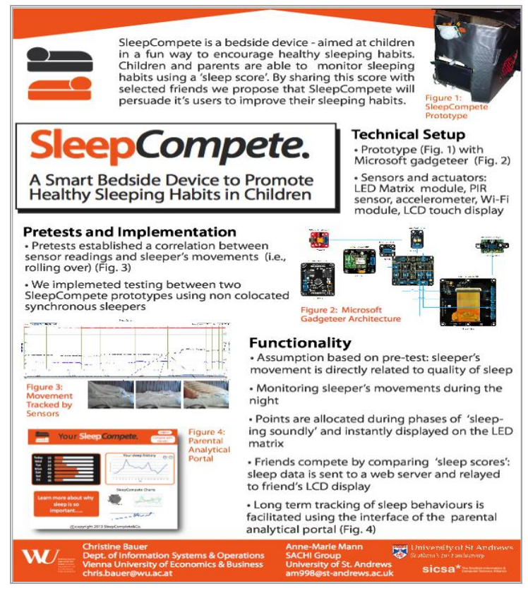
Figure 4: Mockup of SleepCompete Analytical Web Portal

Overall, we believe that our work on SleepCompete can contribute to a better understanding of technology use in family environments that support healthy sleep behaviors, and explore how playful and social interaction with technological devices can positively impact health in a way that supports children and parents alike.